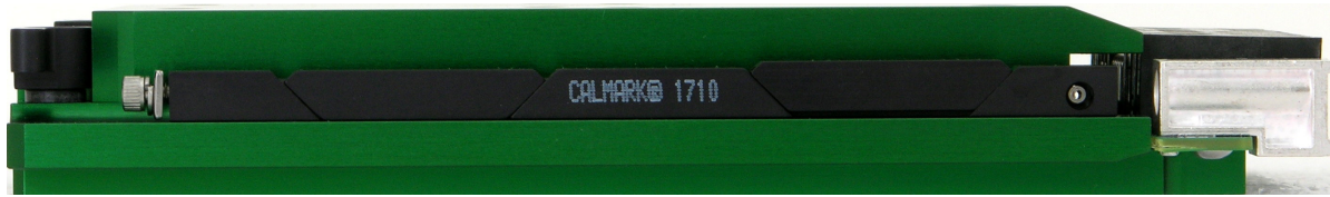
W Cooling Option Shown Side View

Note: AC and 12VDC Nominal input option not available with this P/N