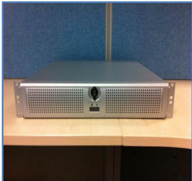
Figure 1 - Sentric VRD-1-ADM

Playback of either video channel is expected to be in synchronization with a selection of 1 to 4 of the recorded audio channels to +/- 1 second, and that the SMS be able to play back two channels of video whilst still recording video input. The SMS must be capable of unmanned 24/7/365 operation, with auto overwrite of the oldest data after 24 hours. In addition, the operator should be able to not only remotely control the SMS but also be able to view recordings via LAN/WAN.