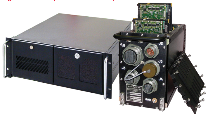
Figure 1: Examples of Sentric2 systems

The API and browser control hides the details of this application from the user by providing a consistent interface to the modules installed.