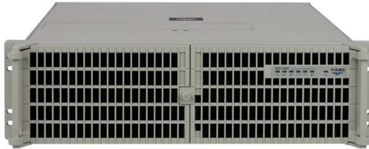
RES-31XR3 shown with optional front panel dust filters